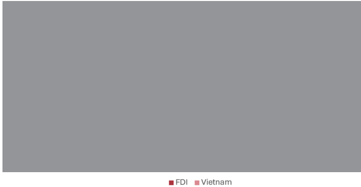
Vietnam's synthetic filament yarn exports in February 2025: Quantity and Value

In February 2025, Vietnam exported 36,650 tons of synthetic filament yarn, a 6.9% increase compared to January. The export value also saw a slight increase of 2.4%, reaching 86.7 million USD.